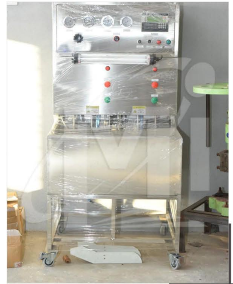
Pressure Checking Machine