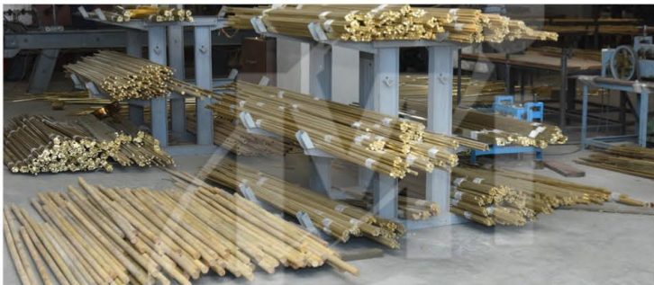
Brass Extrusion Rods