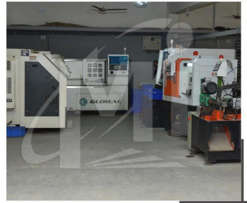
CNC TMC Machine