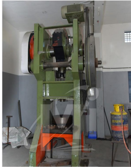
Hollow Forging Machine