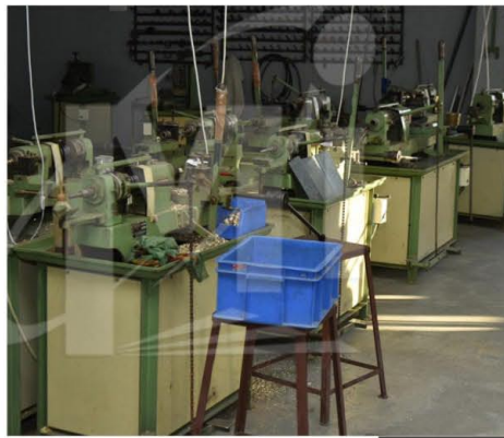
Hand Operated Machineries